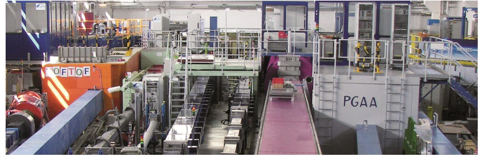
Figure 4: Experimental hall at FRM II in Garching, near Munich

GEMS provides you with state of the art materials analysis well beyond the capabilities of standard laboratory equipment: