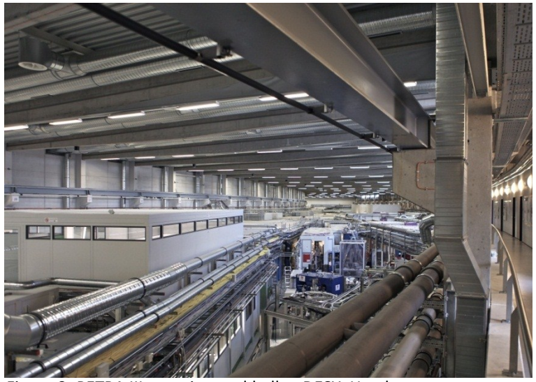
Figure 3: PETRA III experimental hall at DESY, Hamburg

The German Engineering Materials Science Centre (GEMS) is a central user access platform, where the Helmholtz-Zentrum Geesthacht provides worldwide unique infrastructure for complementary research with photons and neutrons. Instruments using synchrotron radiation are operated at the outstation at DESY in Hamburg, instruments using neutrons are located at the outstation at the FRM II Garching, near Munich.