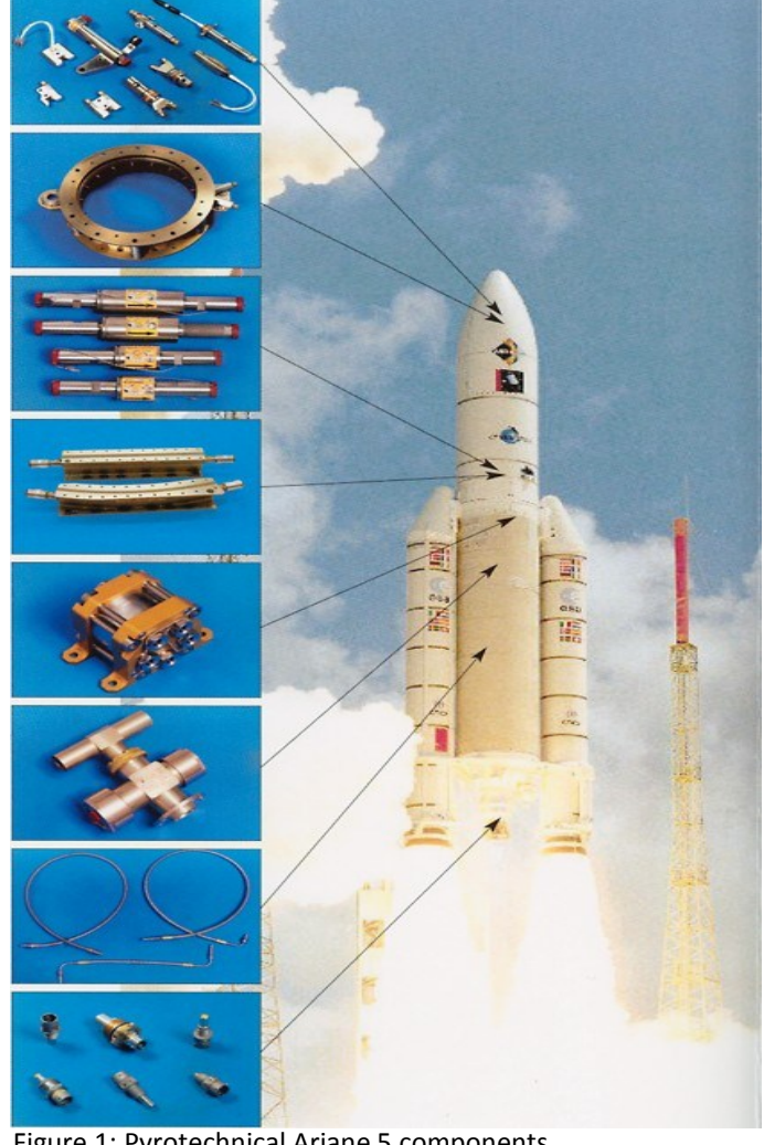
Figure 1: Pyrotechnical Ariane 5 components

Approximately 800 different pyrotechnical devices had to be installed for the launch of Ariane 5. The components include items such as the booster rockets, fuel tanks, items as cable cutters for steel ropes of up to 10 mm thickness, initiators and capsules that contain modern explosives (Hexogen). High density and homogeneity of explosives onboard, for example the initiator being homogeneously filled, are essential for all pyrotechnical devices in order to guarantee a safe and hustle-free operation when in orbit.